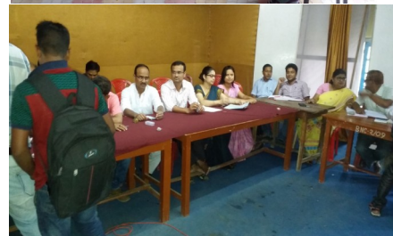
Teachers of the college at the Help Desk and Admission Process during the admission days