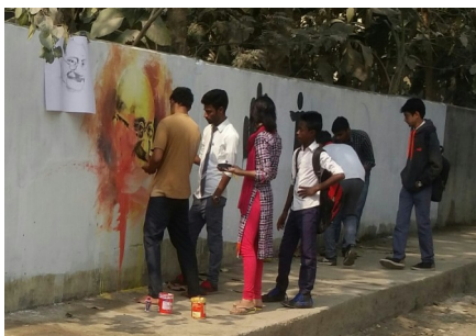
Students busy in Wall Graffiti on the occasion of "Swachh Bharat Abhiyan" 2017.