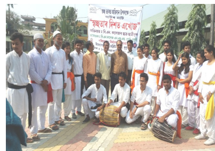
Street Play Team poses with honourable principal of the college.