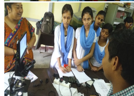
Students of the feeder school of Dhubri Town visit the college Laboratory and SNT Library as part of Organic Linkage Programme between the college and the feeder schools.