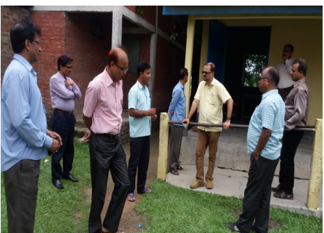
The college family visits the L.P. School of its adopted Village.