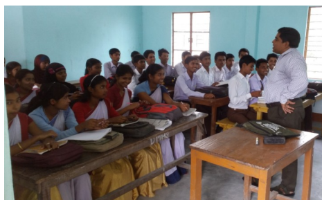
The college is continuing the Organic Linkage Programme with the Feeder Schools of Dhubri Town for the Academic Session 2016 - 2017