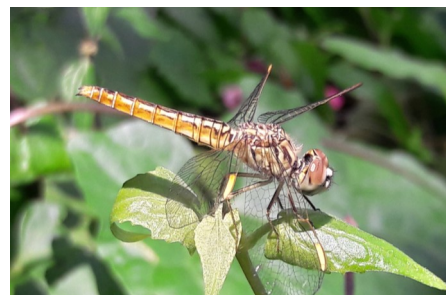
Best Photograph of "On the Spot Photography competition" in connection with World Environment Day 2017 clicked by Rishab Paul of B.Sc. 3rd Semester, Roll No. 960.